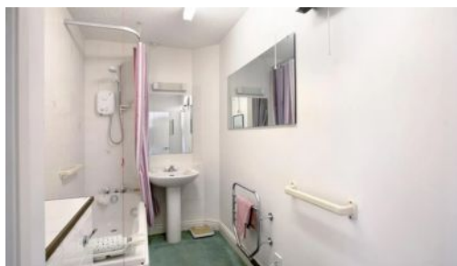
3rd Floor 61.2 sq.m. (659 sq.ft.) approx.