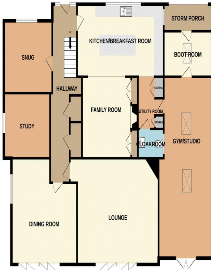
GROUND FLOOR 2047 sq.ft. (190.2 sq.m.) approx.