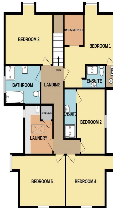
1ST FLOOR 1148 sq.ft. (106.6 sq.m.) approx.