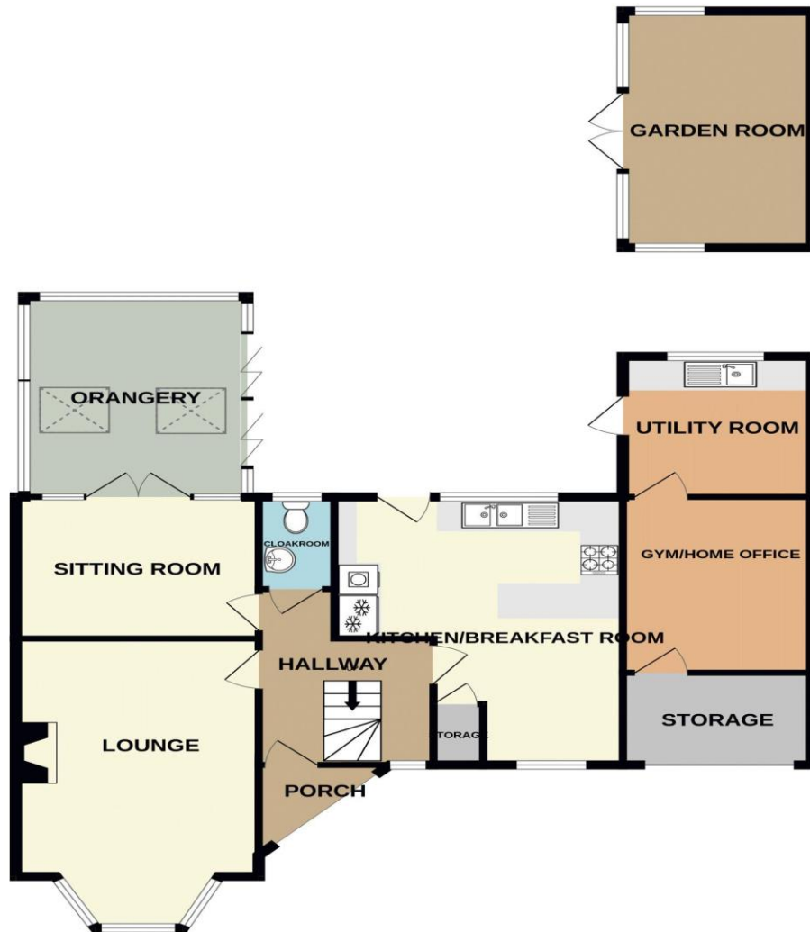
GROUND FLOOR 1139 sq.ft. (105.8 sq.m.) approx.