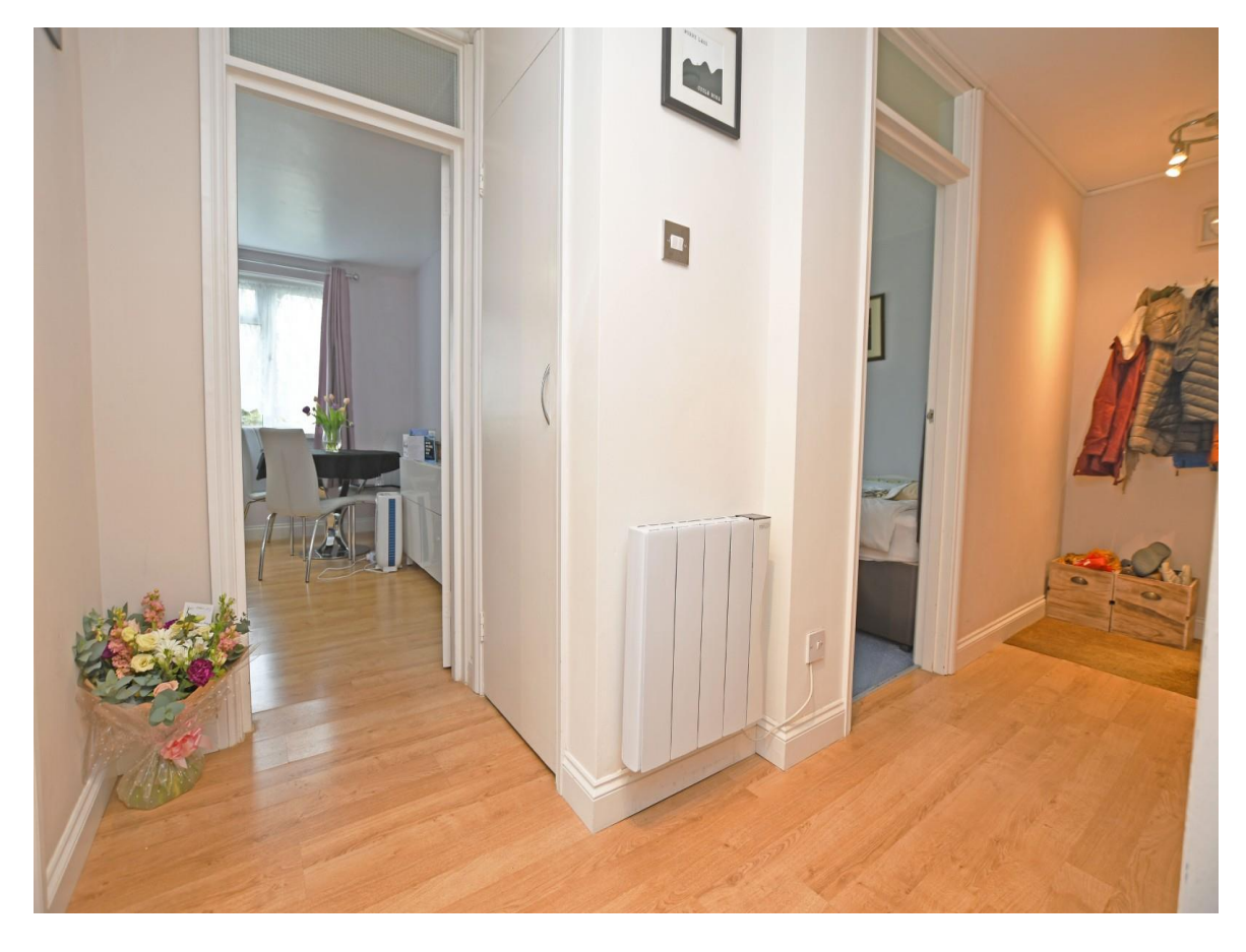
1 Boarley Court Cuckoowood Avenue Maidstone ME14 2NL