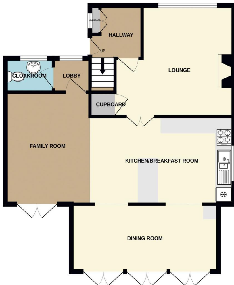
GROUND FLOOR 736 sq.ft. (68.4 sq.m.) approx.