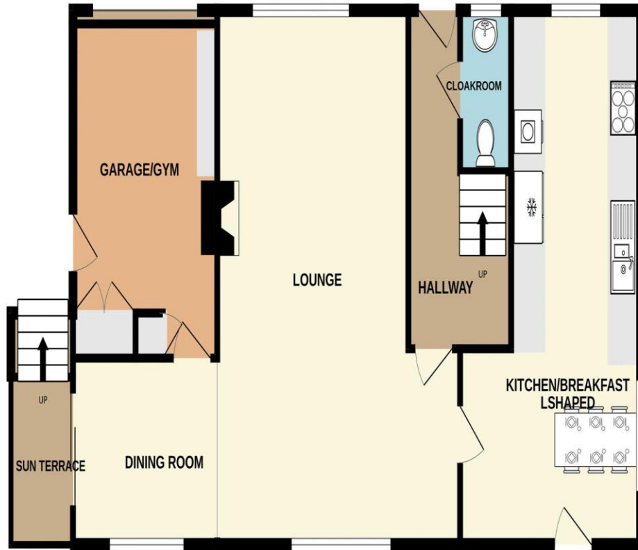
GROUND FLOOR 941 sq.ft. (87.4 sq.m.) approx.