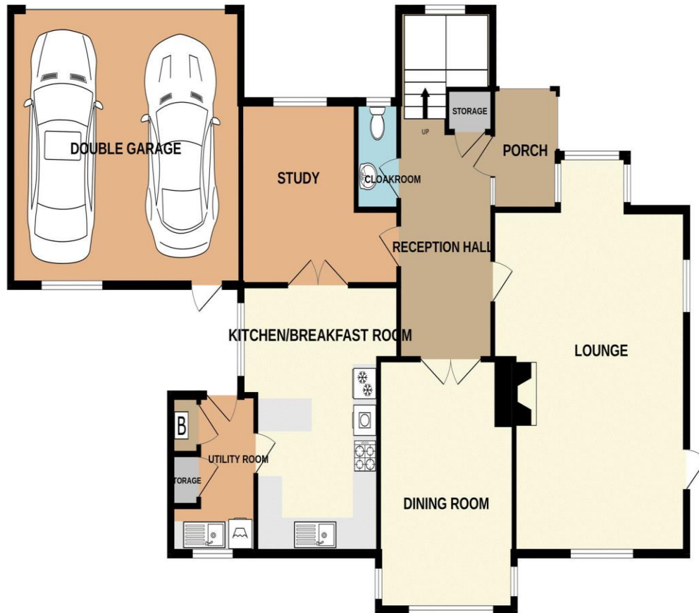
GROUND FLOOR 1454 sq.ft. (135.1 sq.m.) approx.