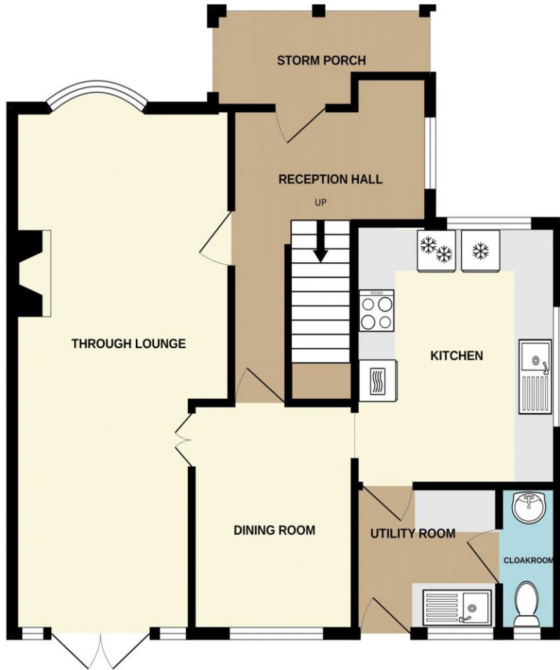
GROUND FLOOR 674 sq.ft. (62.6 sq.m.) approx.