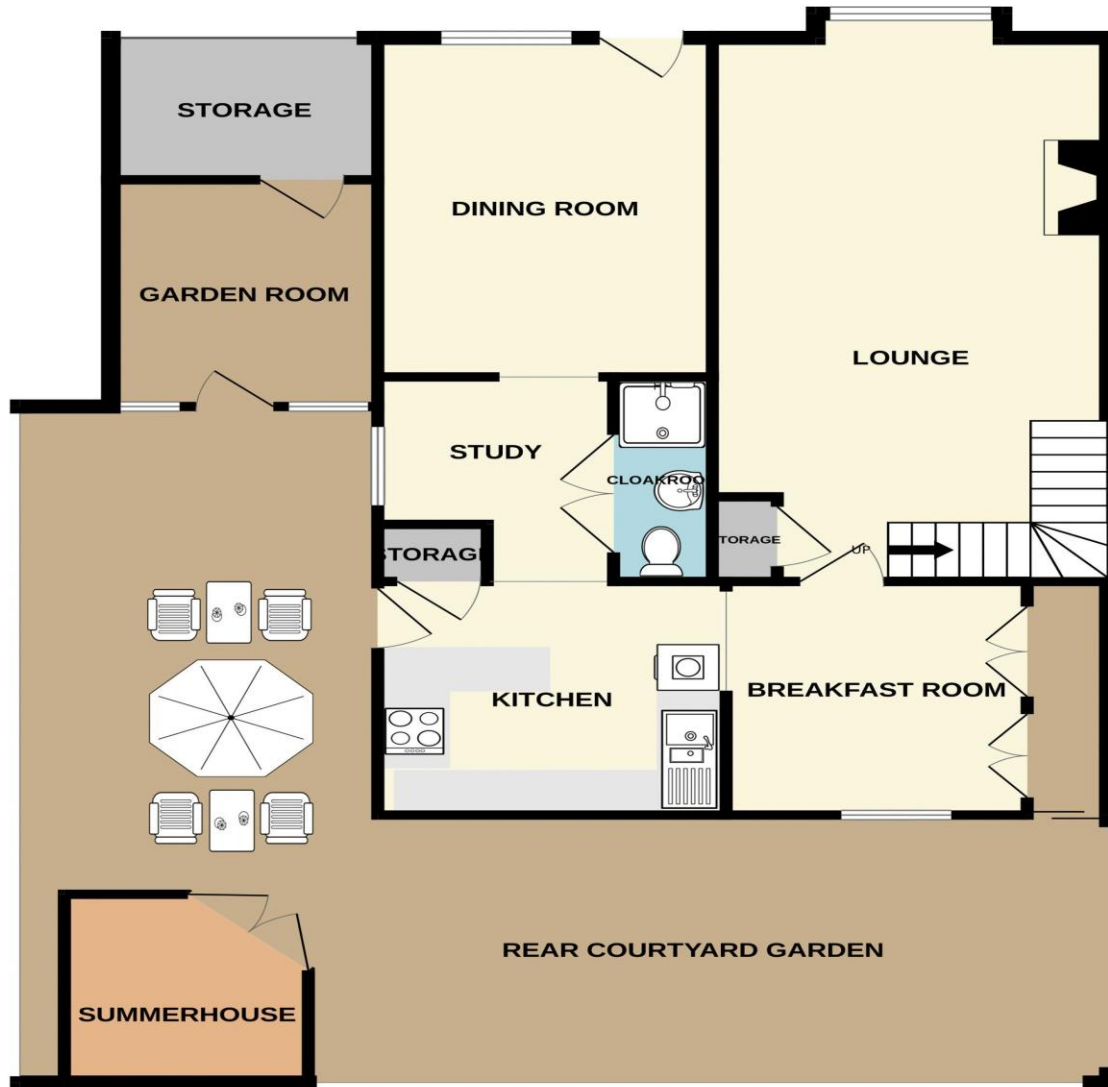
GROUND FLOOR 1383 sq.ft. (128.5 sq.m.) approx.