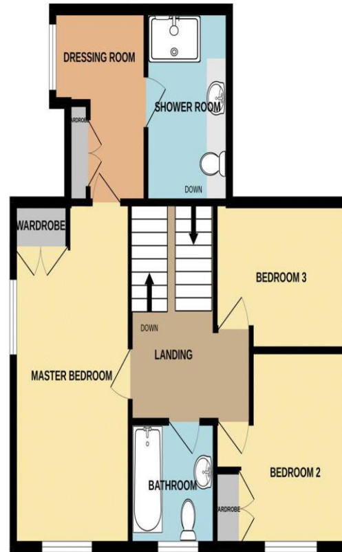
2ND FLOOR 323 sq.ft. (30.0 sq.m.) approx.