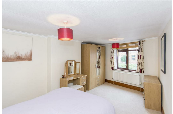
UPVC double-glazed window to front. Radiator.