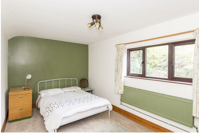
UPVC double-glazed window to garden. Radiator.