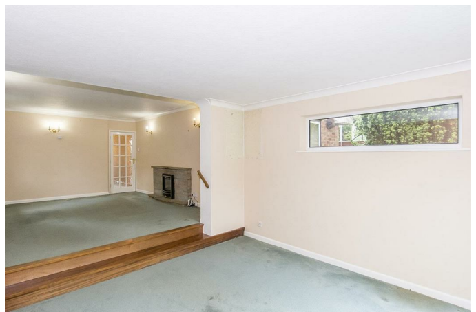
(Dining Room Photo Two)

UPVC double-glazed window to side. UPVC double-glazed sliding patio doors to rear.