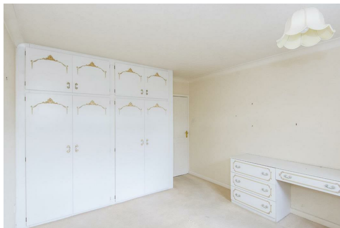
(Bedroom One Photo Two)

UPVC double-glazed bow window to front. Fitted wardrobes and drawer units. Radiator.