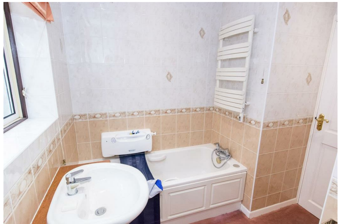
(Bathroom Photo Two)

Opaque UPVC double-glazed window to side. W/C and wash hand basin inset to storage units. Panelled bath with shower mixer tap. Heated towel rail.