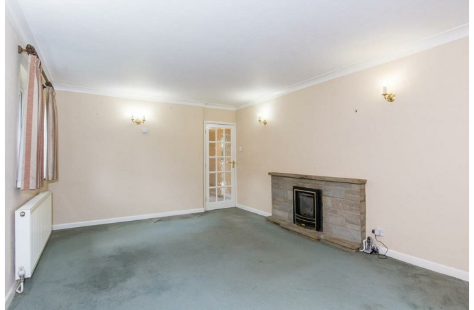
Dining Room 11'9" x 11'4" (3.58m x 3.45m)