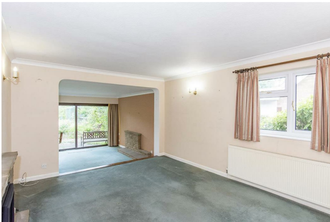
Lounge 15'6" x 12'1" (4.72m x 3.68m)

UPVC double-glazed window to side. Gas fire to stone fire place. Radiator. Opening through to dining room.