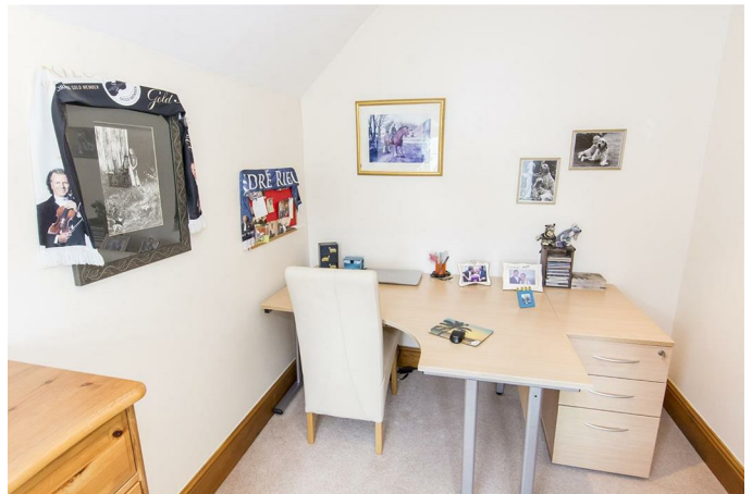
(Bedroom Three Photo Two)

Double-glazed window to side elevation. Built in wardrobe. Radiator.