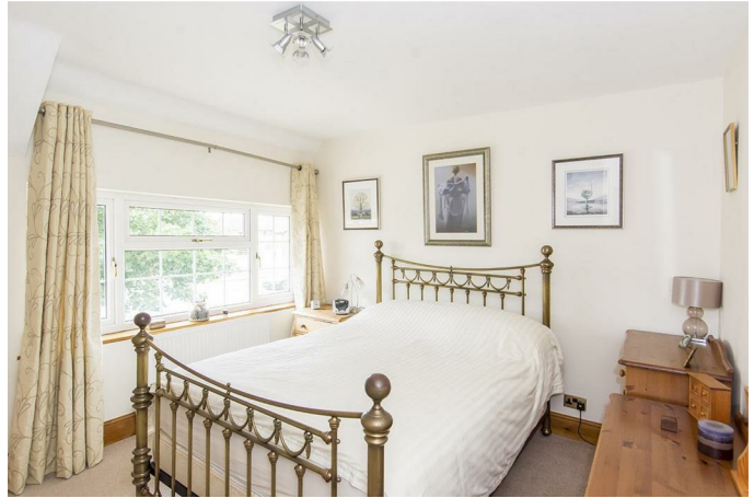
Bedroom One 14'8" max x 10'11" (4.47m max x 3.33m)

Double-glazed windows to front elevation. Fitted wardrobes. Radiator.