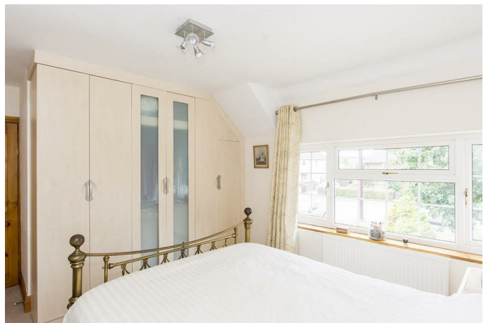
(Bedroom One Photo Two)

Double-glazed windows to front elevation. Fitted wardrobes. Radiator.