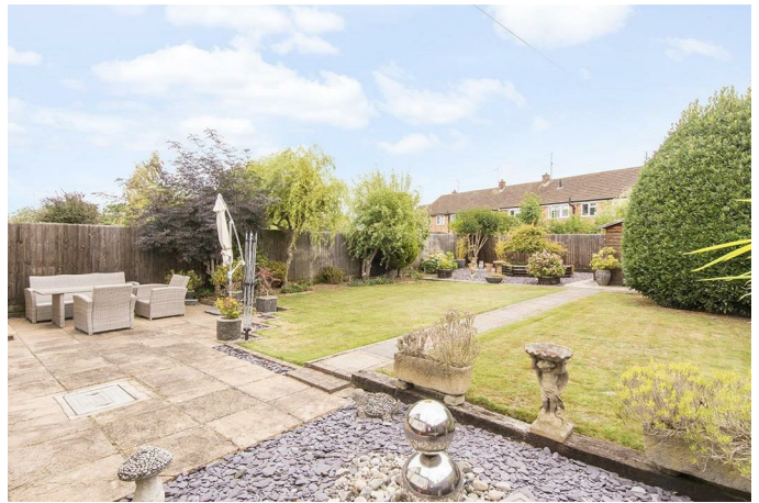
(Rear Garden Photo Two)

Laid mainly to lawn. Paved patio area. Timber slat fencing. Slatted patio with water feature. Timber garden store. Enclosed by timber slat fencing.