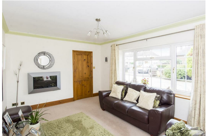
Lounge 14'11" x 10'11" (4.55m x 3.33m)

Double-glazed window to front elevation. Radiator. Telephone point. Television point.