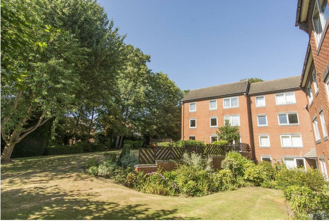
(Communal Gardens Photo Two)