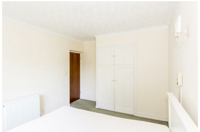
(Bedroom One Photo Two)

UPVC double-glazed window overlooking gardens. Built-in wardrobe. Electric heater.