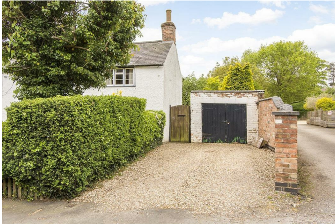
Garage 17'2" x 9'2" (5.23m x 2.79m)

Accessed via double timber doors. Power and light connected.