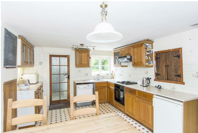
Kitchen/Breakfast Room 15'9" x 11'5" (4.80m x 3.48m)

Dual aspect windows. Medium oak facing fitted base and wall units. Fitted oven and four ring gas hob. Stainless steel sink and double drainer. Space and plumbing for washing machine. Radiator. Laminated work-surfaces with complementary tiled splash-backs. Serving hatch through to dining room. Opaque multi-paned door to utility/rear hall.