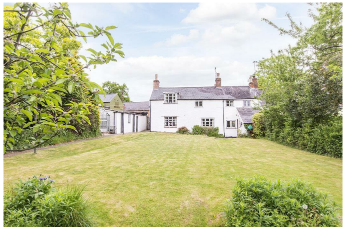
Workshop 10'7" x 9'2" (3.23m x 2.79m)