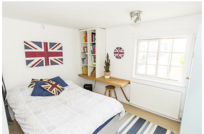
Bedroom Two 11'5" x 11'3" max (3.48m x 3.43m max)

Multi paned window to the front aspect. Radiator. Fitted wardrobe.