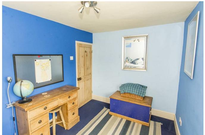
(Bedroom Four Photo Two)

Double glazed window to the rear aspect. Radiator.