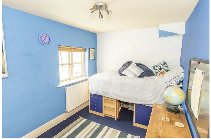
Bedroom Four 9'11" x 7'6" (3.02m x 2.29m)