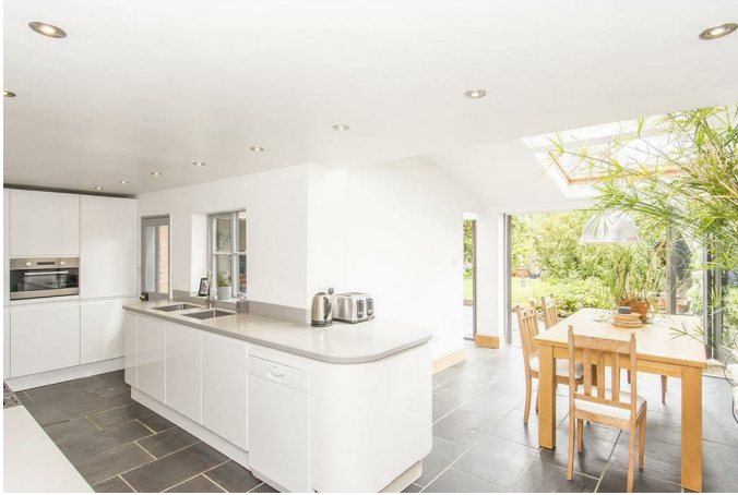
Kitchen Area (Photo Two)