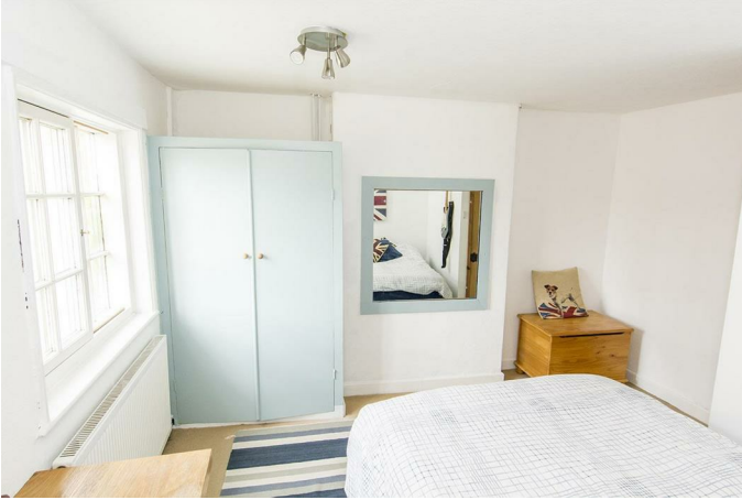
(Bedroom Two Photo Two)