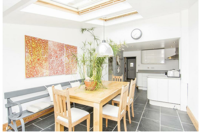
(Breakfast Area Photo Two)