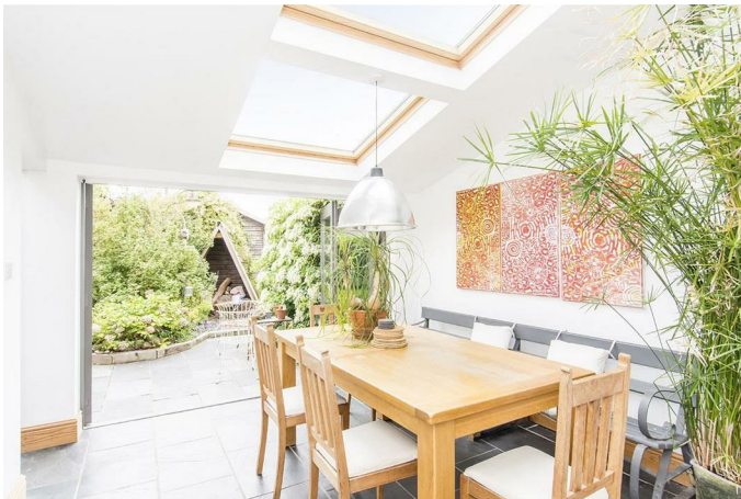
Breakfast Area 10'10" x 10'5" (3.30m x 3.18m)