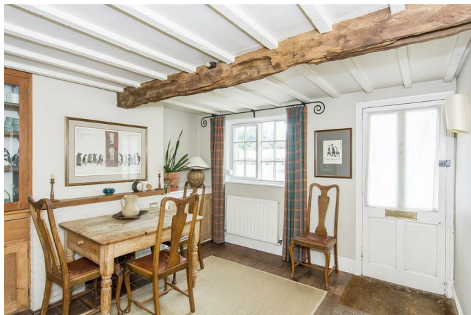
Dining Room 11'6" x 11'6" (3.51m x 3.51m)

Accessed via glazed timber front door. Multi paned double glazed window to the front. Brick constructed open fireplace. Fitted glazed display cabinets and base unit. Exposed ceiling beams. Woodblock flooring. Two wall lights. Radiator. Doors to the front lounge and kitchen area.