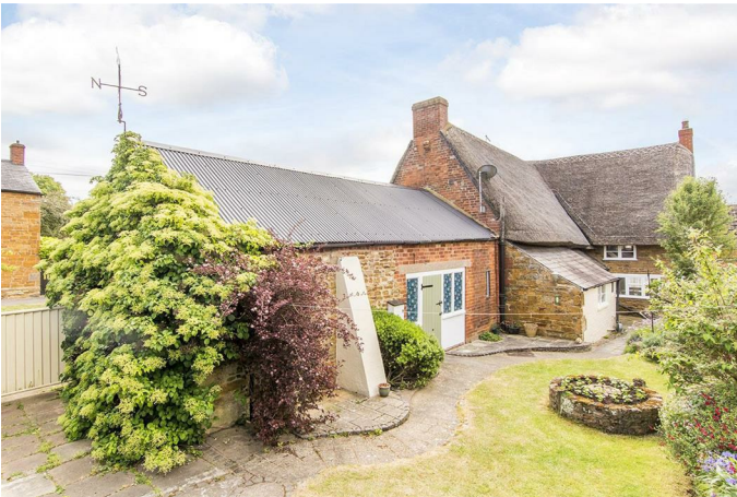
(Rear Aspect Photo)