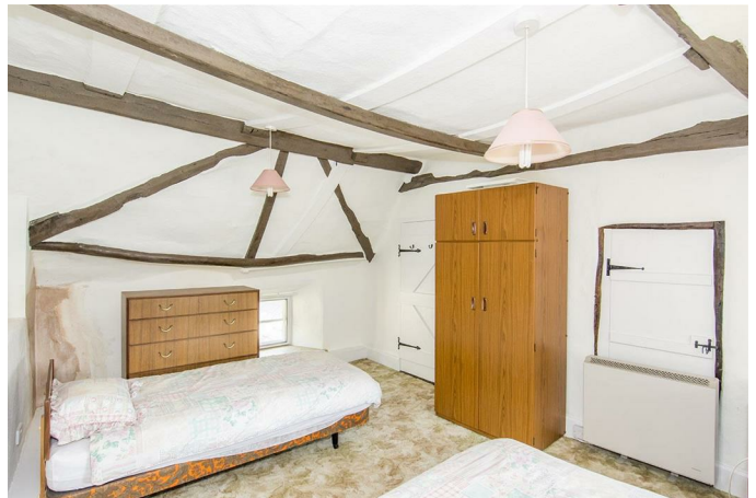
(Bedroom Three Photo Two)

Dual aspect windows. Exposed wall timbers. Electric storage heater.