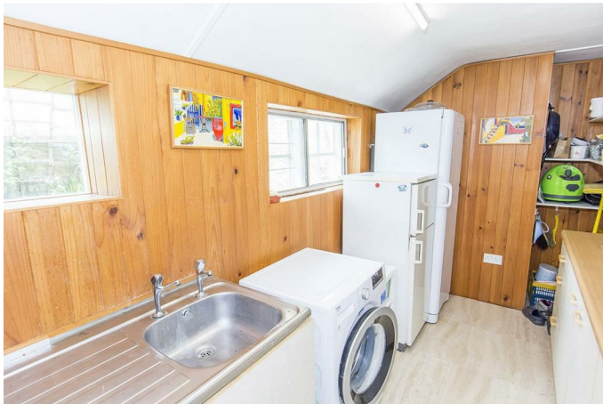
Utility Room 12'8" x 6'0" (3.86m x 1.83m)

Fitted base and wall units. Laminated work surfaces. Stainless steel sink and drainer. Space and plumbing for automatic washing machine. Tiled flooring. Two windows to the rear aspect.