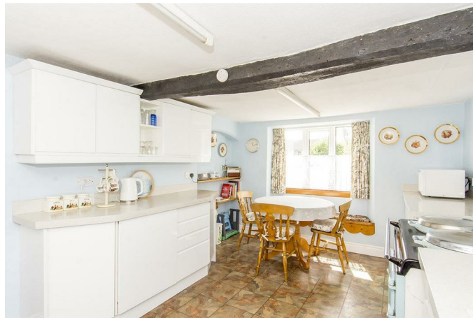
(Kitchen Photo Two)