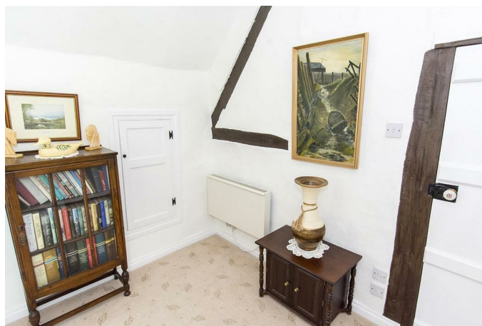
Dressing Room 10'3" max x 8'11" max (3.12m max x 2.72m max)

Double glazed window to the front aspect. Electric radiator. Exposed wall timbers. Built in storage cupboard. Doors to bathroom and bedroom one.