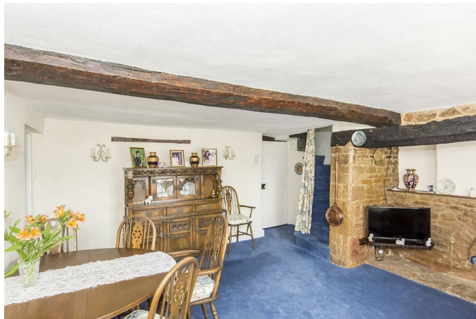
(Dining Room Photo Two)