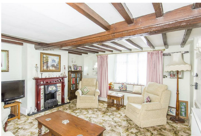
Lounge 14'1" x 13'10" (4.29m x 4.22m)

Multi paned secondary glazed window to the front and original feature period 'cloverleaf' window. Feature timber fire surround and tile cheeks incorporating coal effect fitted electric fire. Exposed ceiling beams. Fitted window seat. Shelved display recess. Four wall lights. Television point. Electric radiator.