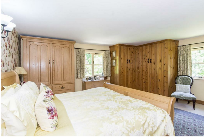
Bedroom One 15'10" x 14'10" (4.83m x 4.52m)

Double-glazed windows to front and side elevations. Fitted wardrobes. Radiator. Wall light. Door to en-suite.