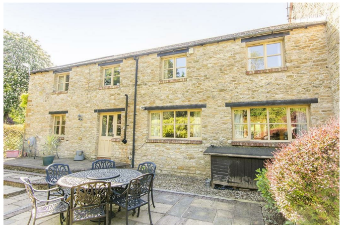
(Further Courtyard Garden Photo Two)

Accessed via garden room. Mainly paved with raised floral borders. Enclosed by brick wall. Outside lighting. Private.