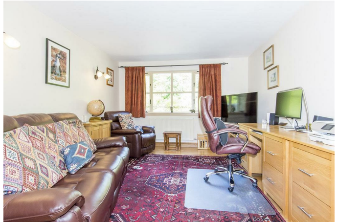
Study 14'9" x 11'3" (4.50m x 3.43m)