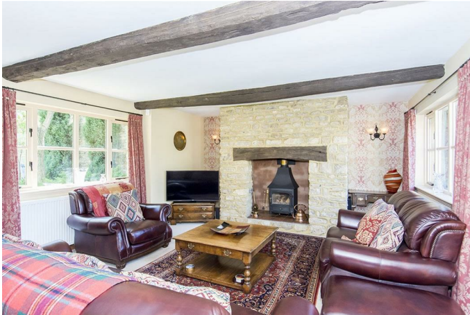
(Lounge Photo Two)