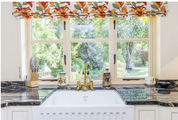
(View From Kitchen)