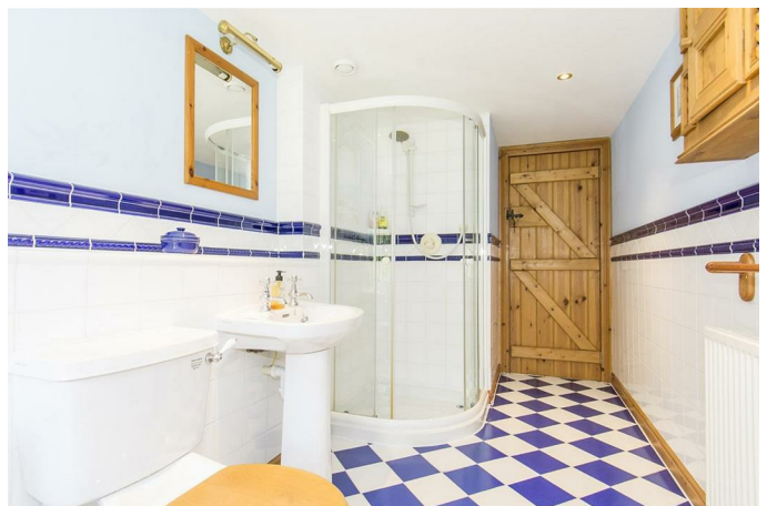
(Family Bathroom Photo Two)

Roll top bath. Pedestal wash hand basin and low-level WC. Shower cubicle with mains shower fitment. Complementary tiled walls and flooring. Radiator. Electric shaver point. Double-glazed window to rear.