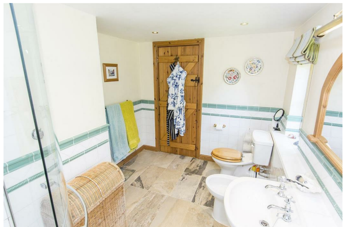
(En-Suite Photo Two)

Large fitted shower cubicle with rain style mains shower fitment. Pedestal wash hand basin, bidet and low-level WC. Two double-glazed windows. Half-height tiled walls. Tiled flooring. Electric shaver point. Radiator.