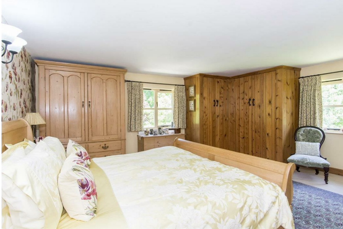
Bedroom One 15'10" x 14'10" (4.83m x 4.52m)

Double-glazed windows to front and side elevations. Fitted wardrobes. Radiator. Wall light. Door to en-suite.