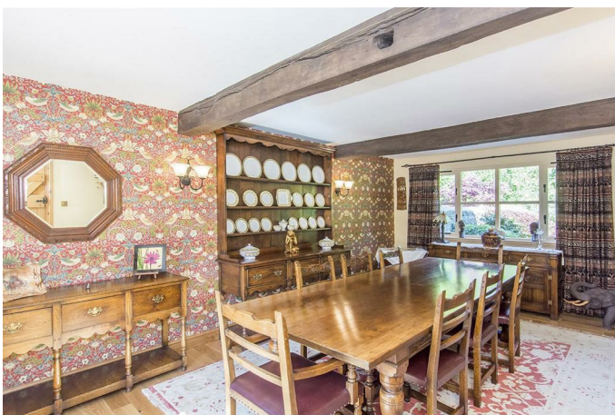
(Dining Room Photo Two)

Engineered oak flooring. Double-glazed window to side elevation. Two wall lights. Television point.