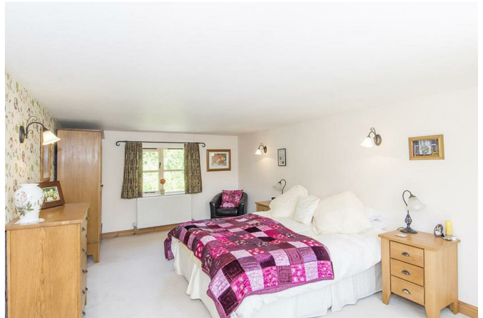
(Bedroom Three Photo Two)

Double-glazed dual aspects windows. Built-in double wardrobe. Radiator.