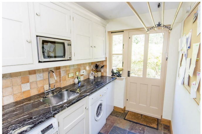
(Utility Room Photo Two)

Fitted base and wall units. Marble work-surfaces and complementary tiled splash-backs. Space and plumbing for automatic washing machine. Space for American style fridge-freezer. Fitted wine fridge. Oil-fired central heating boiler. Double-glazed window to side elevation. Double-glazed door leading outside.