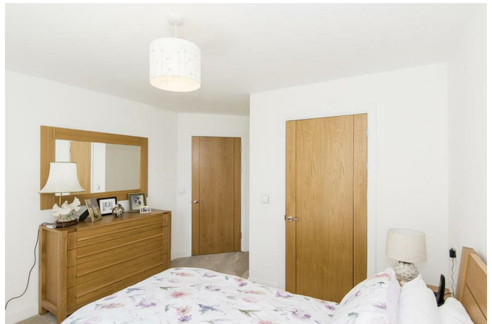
(Bedroom Photo Two)

Double-glazed window to rear elevation. Radiator. Television point. Telephone point. Large walk-in wardrobe.