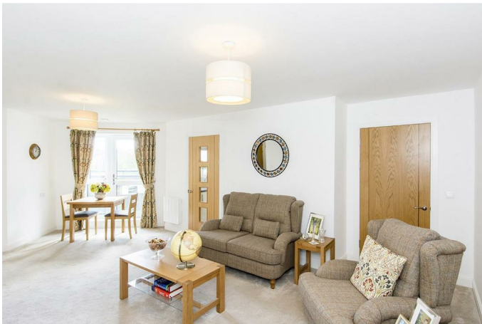
Lounge/Diner 19'9" x 14'6" (6.02m x 4.42m)

Double-glazed French doors opening out to Juliet balcony to rear. Two radiators. Spacious walk-in storage cupboard. Glazed door to kitchen.