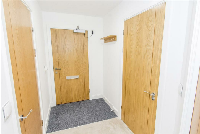
Entrance Hall 13'9" x 4'10" (4.19m x 1.47m)

Accessed via composite front door. Electric radiator. Spacious walk-in linen cupboard housing lagged hot water tank.