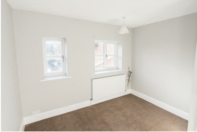
Bedroom Two 10'1" x 9'8" (3.07 x 2.95)

10' 1" x 9' 8" to face of wardrobe (3.07m x 2.95m) Two double glazed windows to the front elevation. Radiator. Built in wardrobe. Airing cupboard housing electric water fed boiler.