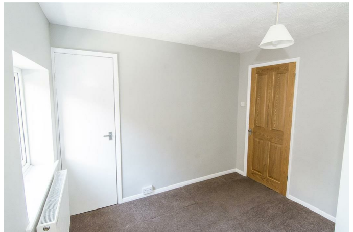
(Bedroom Three Photo Two)

9' 7" x 9' 5" (2.92m x 2.87m) Double glazed window to the side elevation. Built in wardrobe. Radiator.