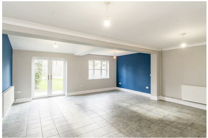
(Lounge/Diner Photo Two)

22' 5" x 20' (6.83m x 6.10m) Double glazed window to the rear elevation. Double glazed French doors leading out to the rear garden. Ceramic tiled flooring. Two radiators. Television point. Opening to:-