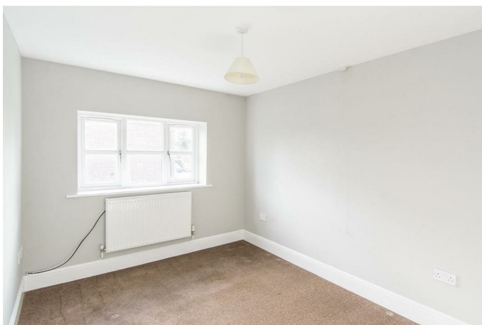
Bedroom One 11'10" x 8'8" (3.61 x 2.64)

11' 10" x 8' 8" (3.61m x 2.64m) Double glazed window to the rear elevation. Radiator. Television point. Access to loft space. Door to:-