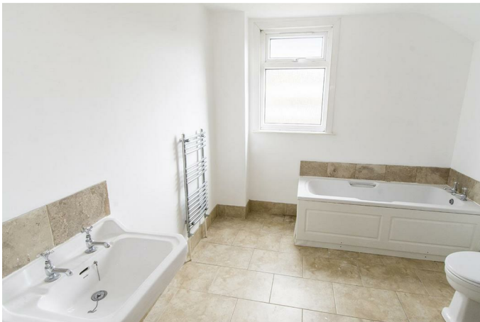
Bathroom 9'10" x 8'11" (3.00m x 2.72m)

Panelled bath. Corner shower cubicle with electric shower fitment. Pedestal wash hand basin. Low level WC. Ceramic tiled flooring. Heated towel rail. Opaque double glazed window.