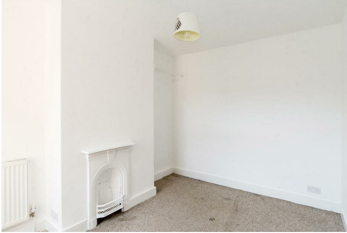
Bedroom Two 11'0" x 8'10 (3.35m x 2.69m)

Double glazed window to the rear aspect. Feature period cast iron open fireplace. Radiator.