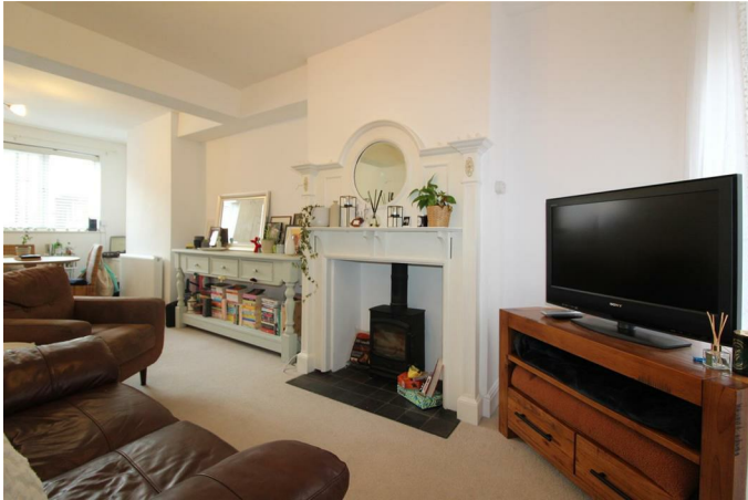
Living Room 23'3" x 11'5" (7.09m x 3.48m)

Accessed via upvc front door. Double glazed window to the front elevation. Double glazed French doors opening out to the rear. Feature cast iron woodburning stove with mirrored timber surround. Two radiators. Television point. Door to:-