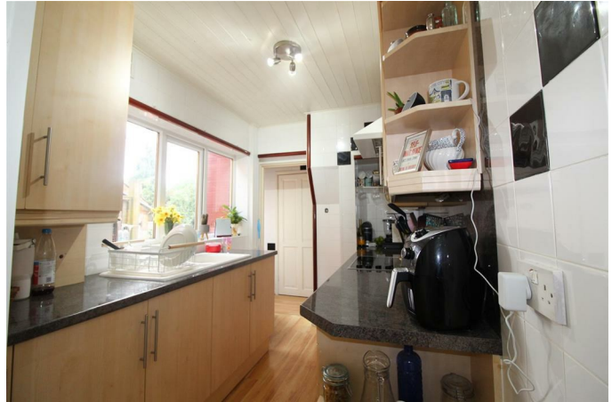
Kitchen 9'9" 6'6" (2.97m x 1.98m)

Fitted base units with laminated worksurfaces over. Fitted oven and four ring electric hob with extractor hood over. One and a half sink and drainer. Complementary tiling. Wood laminate flooring. Double glazed window to the side elevation. Doorway to:-