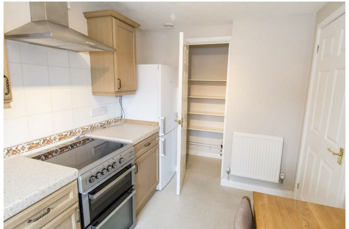
(Kitchen Photo Two)

UPVC double glazed window to front. Fitted with a range of wall and floor mounted units with roll edge worktops. One and a half bowl sink. Space for cooker and fridge. Space and plumbing for washing machine. Pantry cupboard. Tiled splash backs. Emergency pull cord. Radiator.