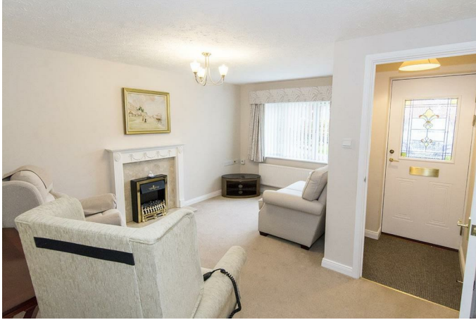
Lounge 14'4" x 12'9" (4.37m x 3.89m)

UPVC double glazed window to front. Electric fire with marble back panel and hearth. Phone point. TV point. Emergency pull cord. Radiator.