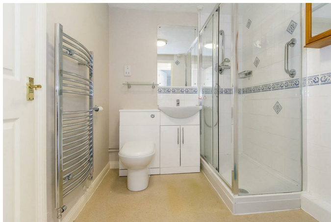
Shower Room 7'7 x 6'4 (2.31m x 1.93m)

White three piece suite comprising WC, wash hand basin and shower cubicle. Tiled splash backs. Shaver point. Extractor fan. Emergency pull cord. Airing cupboard housing boiler. Radiator.