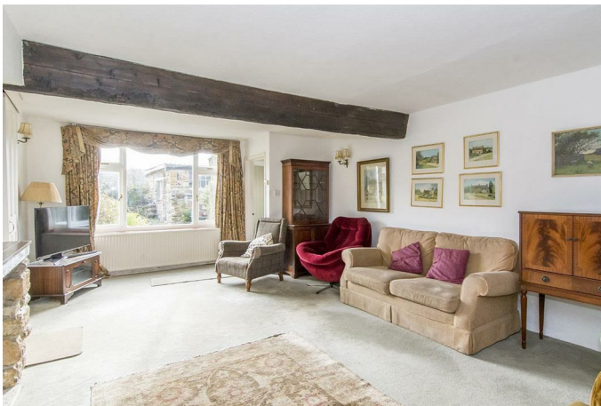
Lounge 20'0 x 12'11 (6.10m x 3.94m)

Double glazed window to rear aspect and a high level window to front aspect. Feature open fireplace. TV point. 2 x Radiators.