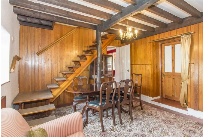
Entrance Hall/Dining Room 14'6 x 12'6 (4.42m x 3.81m)

Accessed via wooden front door. Doors off to: Lounge, snug and utility. Stairs rising to: First floor. Window to front aspect. Feature open fireplace. Quarry tiled flooring. Radiator.