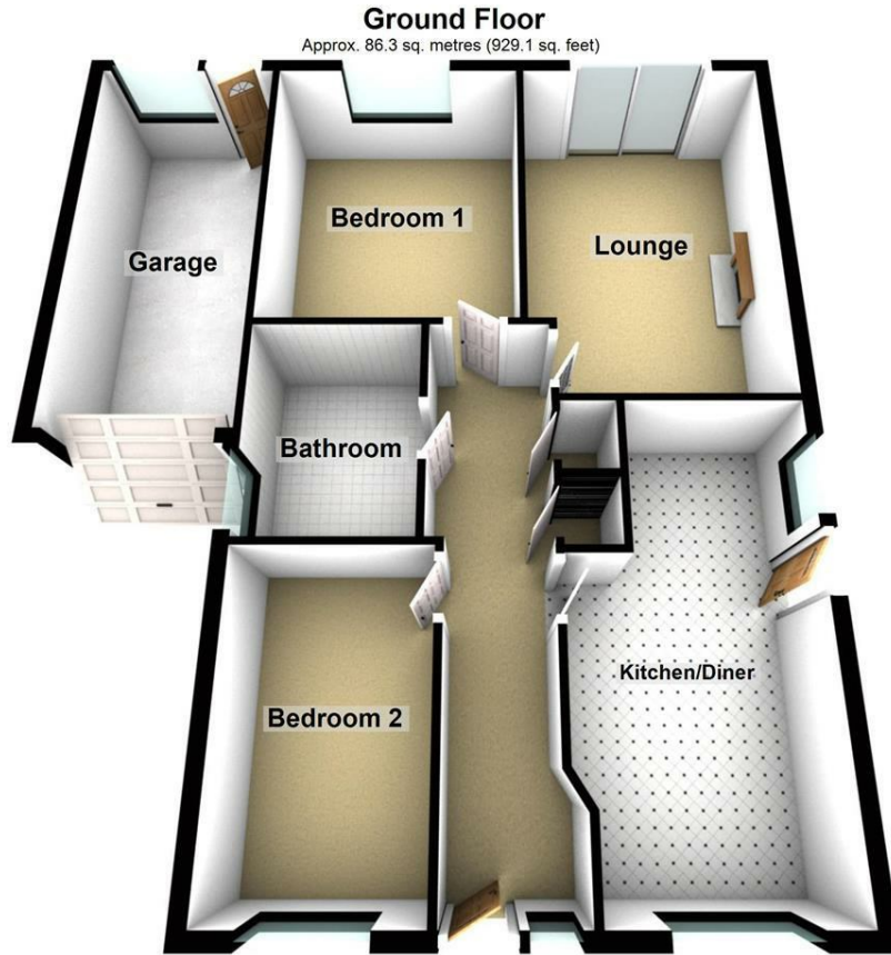
Ground Floor Approx. 86.3 sq. metres (929.1 sq. feet)

Total area: approx. 86.3 sq. metres (929.1 sq. feet)