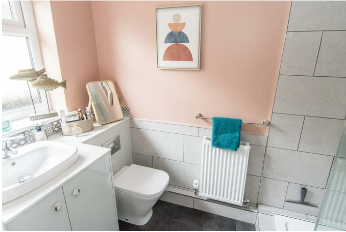
Shower Room 8'6 x 4'6 (2.59m x 1.37m)

Comprising: Double shower enclosure with glass shower screen, sink within fitted vanity unit and a low level WC. There is feature wall tiling to shower area and 1/2 wall tiling throughout and tiled flooring. UPVC double glazed window to side aspect. Radiator.