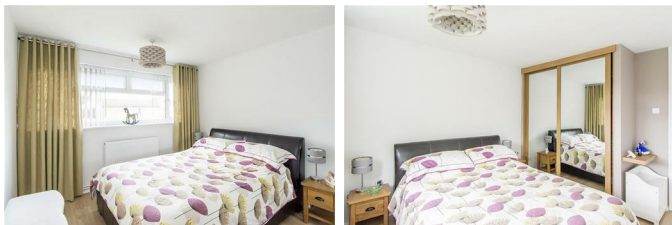
Bedroom One 12'0 (max) x 10'5 (3.66m (max) x 3.18m)

UPVC double glazed window to front aspect. Built-in wardrobes with sliding mirrored doors. High quality wooden laminate flooring. Radiator.