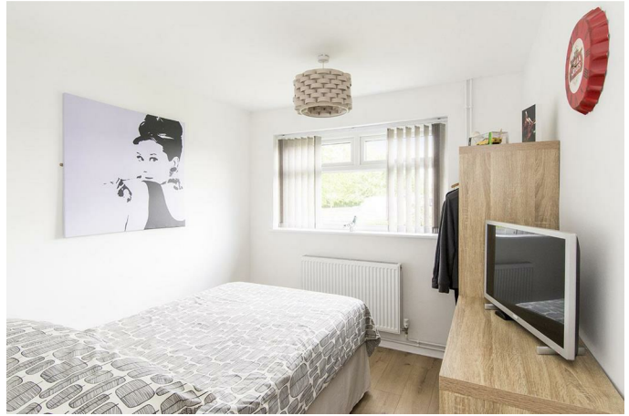
Bedroom Two 12'0 (max) x 8'9 (3.66m (max) x 2.67m)

UPVC double glazed window to front aspect. High quality wooden laminate flooring. Radiator.