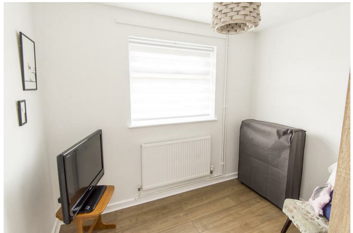
Bedroom Three 9'1 x 7'8 (2.77m x 2.34m)

UPVC double glazed window to side aspect. High quality wooden laminate flooring. Radiator.