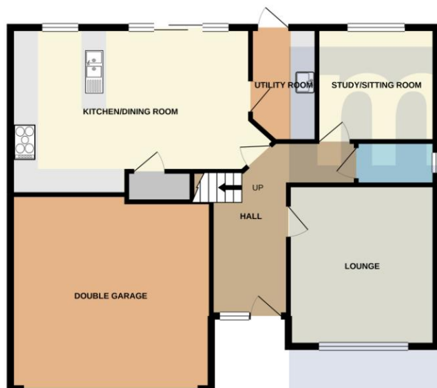
GROUND FLOOR 962 sq.ft. (89.4 sq.m.) approx.