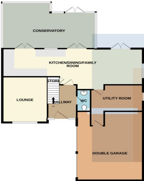
GROUND FLOOR 1355 sq.ft. (125.9 sq.m.) approx.