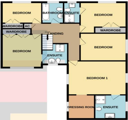
1ST FLOOR 1064 sq.ft. (98.9 sq.m.) approx.