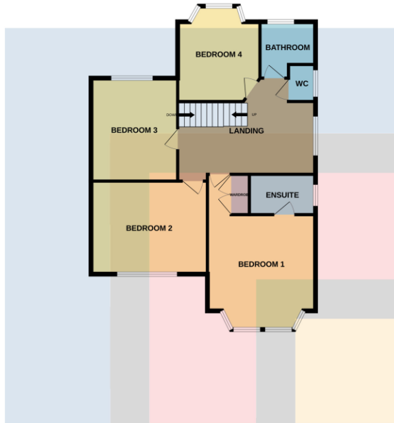
1ST FLOOR 887 sq.ft. (82.4 sq.m.) approx.