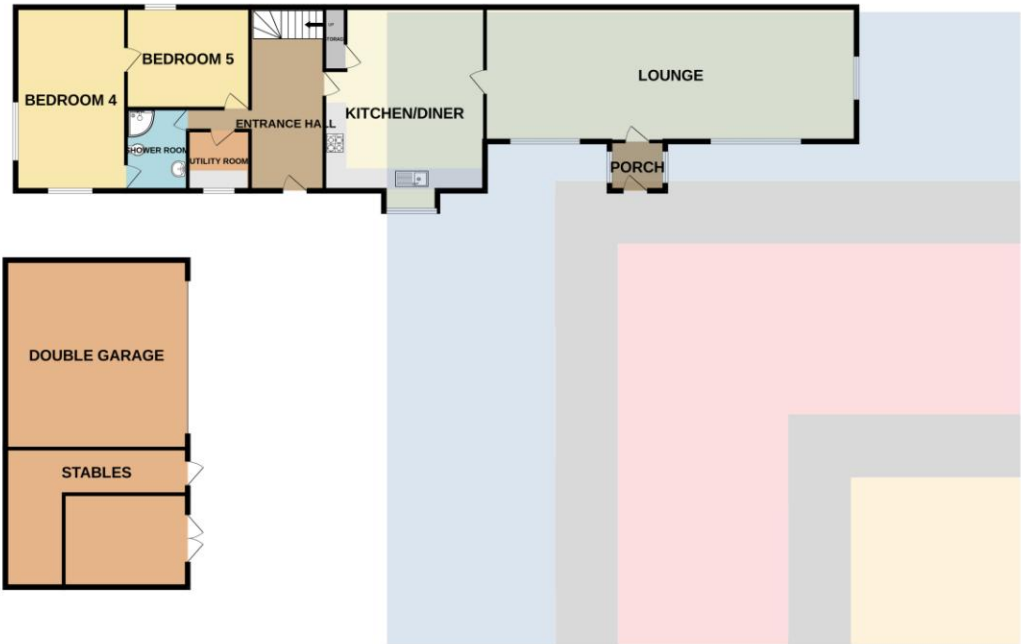
GROUND FLOOR 2216 sq.ft. (205.6 sq.m.) approx.