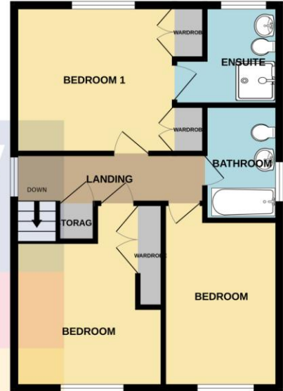
1ST FLOOR 546 sq.ft. (50.7 sq.m.) approx.