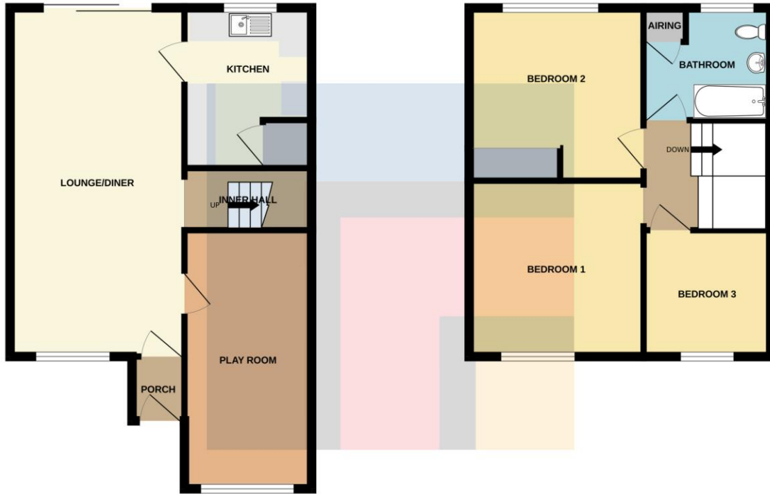
TOTAL FLOOR AREA : 898 sq.ft. (83.4 sq.m.) approx.

Whilst every attempt has been made to ensure the accuracy of the floorplan contained here, measurements of doors, windows, rooms and any other items are approximate and no responsibility is taken for any error, omission or mis-statement. This plan is for illustrative purposes only and should be used as such by any prospective purchaser. The services, systems and appliances shown have not been tested and no guarantee as to their operability or efficiency can be given. Made with Metropix ©2024