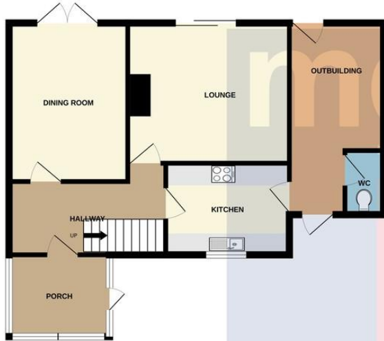
GROUND FLOOR 607 sq.ft. (56.4 sq.m.) approx.