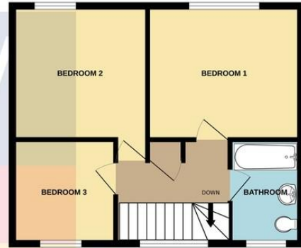
1ST FLOOR 436 sq.ft. (40.5 sq.m.) approx.