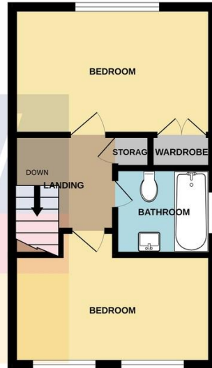
1ST FLOOR 286 sq.ft. (26.6 sq.m.) approx.