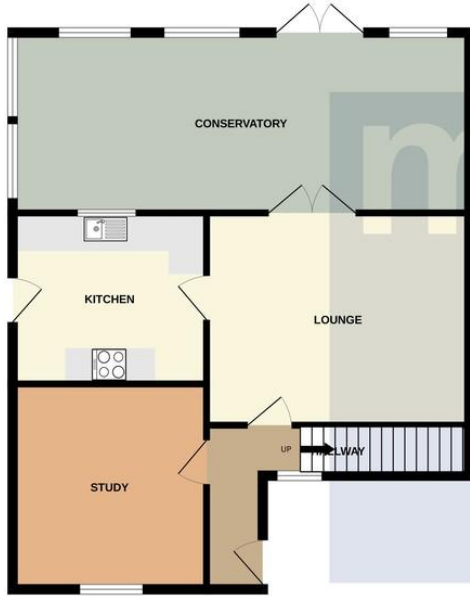
GROUND FLOOR 745 sq.ft. (69.3 sq.m.) approx.