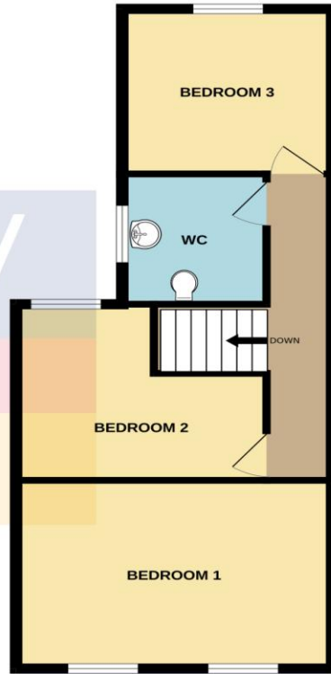
1ST FLOOR 486 sq.ft. (45.2 sq.m.) approx.