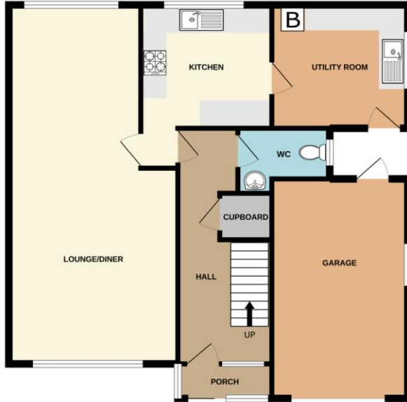
GROUND FLOOR 905 sq.ft. (84.1 sq.m.) approx.