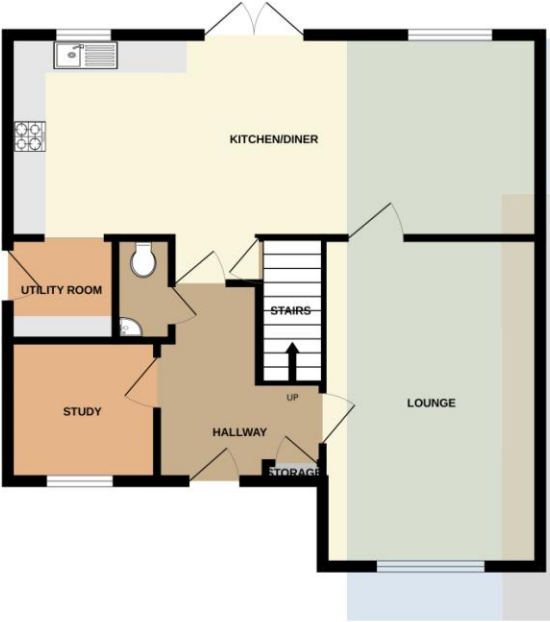
GROUND FLOOR 638 sq.ft. (59.3 sq.m.) approx.