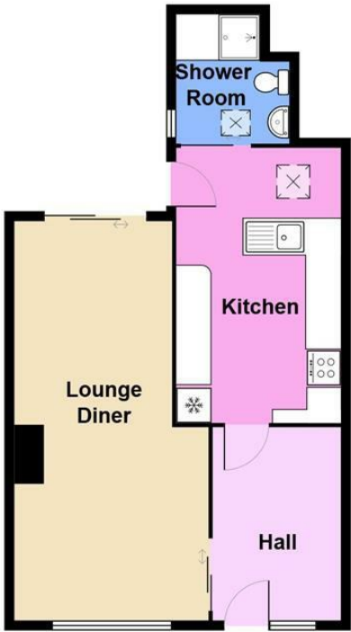
1st Floor Area: 37.3 m 2 ... 401 ft 2