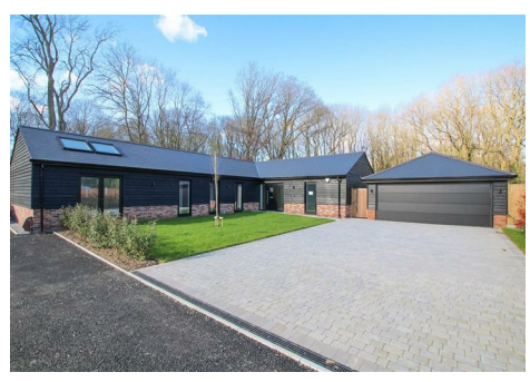
Harrington Lodge Broomhills Chase, Little Burstead, Billericay, CM12 9TE