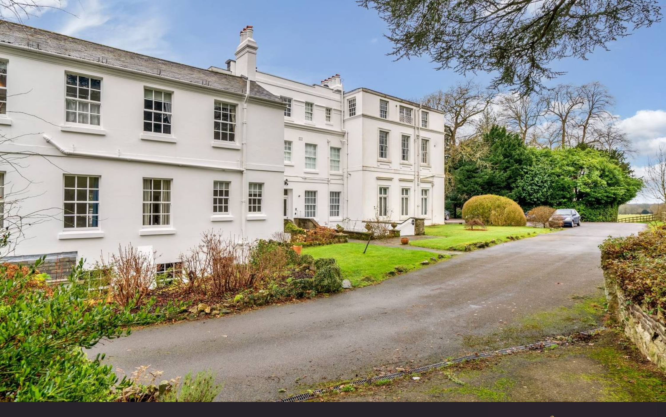
Flat 1, Southlands House, Southlands Lane, Tandridge - RH8 9PH