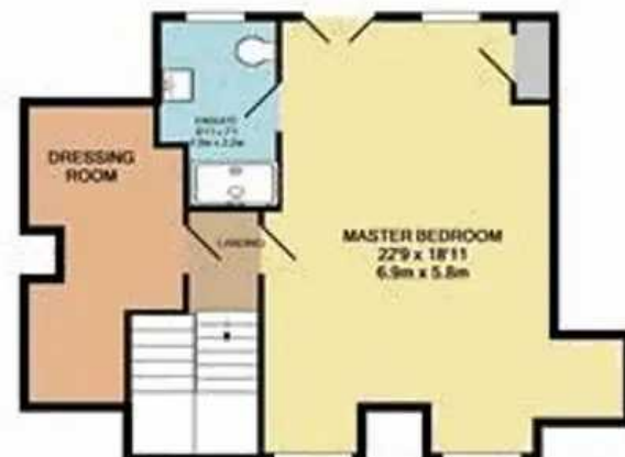
1ST FLOOR APPROX. FLOOR AREA 378 SQ FT (35.1 SQ M)

TOTAL APPROX. FLOOR AREA 2656 SQ FT (245.6 SQ M) Measurements shown have been made to ensure the accuracy of the floor plan contained here. Measurements of doors, windows, rooms and any other items are approximate and are not intended to be used for any legal, insurance, or real-estate purposes. This plan is for illustrative purposes only and should be used as such by any prospective purchaser. The services, fixtures and appliances shown here are not intended to be guaranteed in any way. Measurements are for information only and are not intended to be used for any legal, insurance, or real-estate purposes. Measurements are for information only and are not intended to be used for any legal, insurance, or real-estate purposes. Made with Method 40218