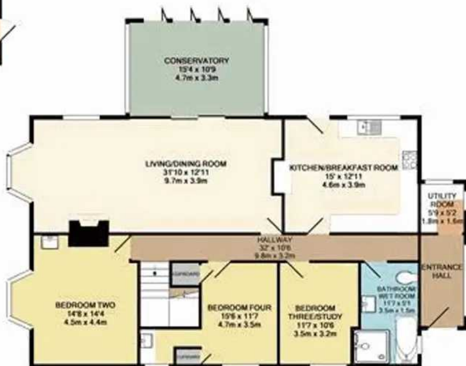
GROUND FLOOR APPROX. FLOOR AREA 228 SQ FT (21.1 SQ M)