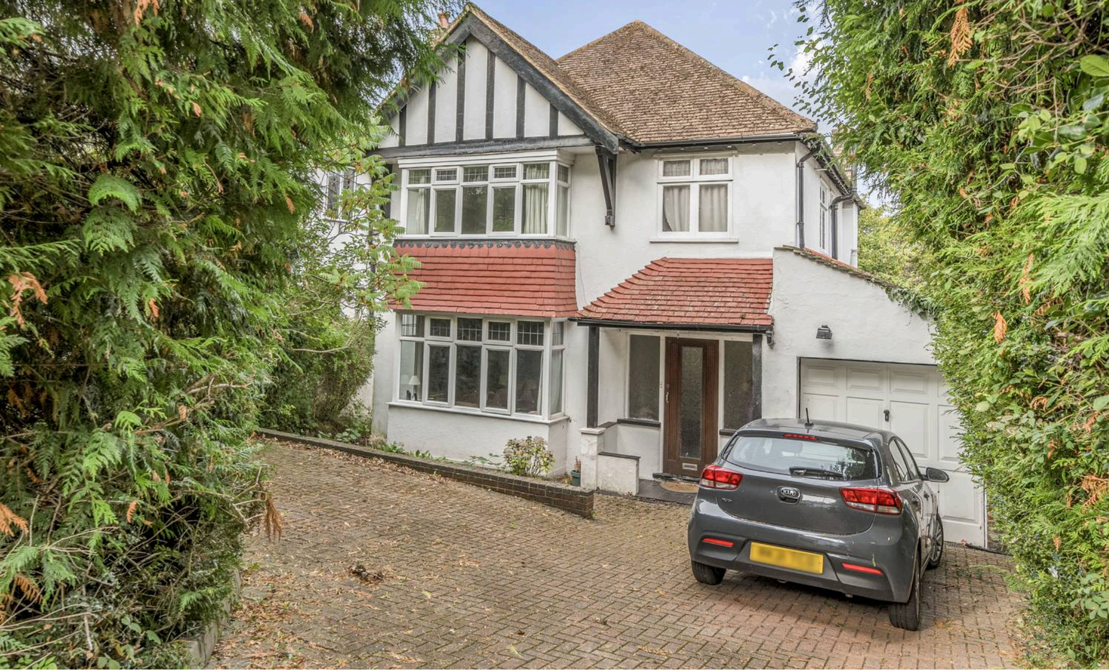
46 Hartley Down, Purley – CR8 4EA £550,000