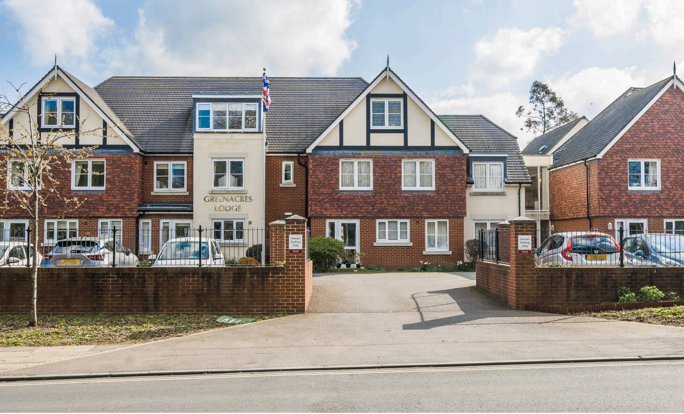
Apt 26, Greenacres Lodge, 287 Limpsfield Road – CR6 9FA £300,000