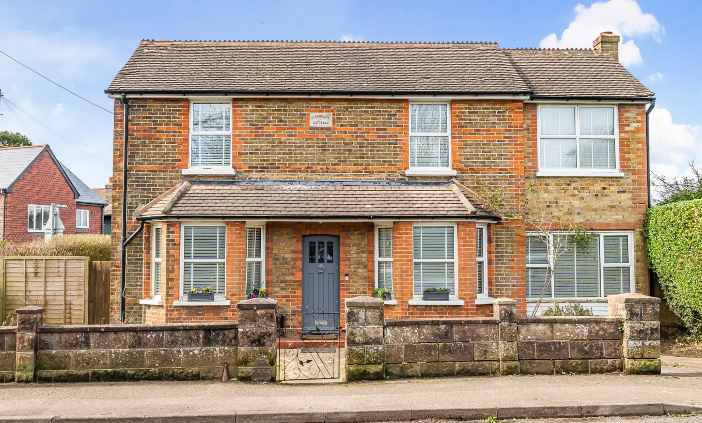
Alexandra Cottage, Chelsham Road, Warlingham - CR6 9EQ £775,000