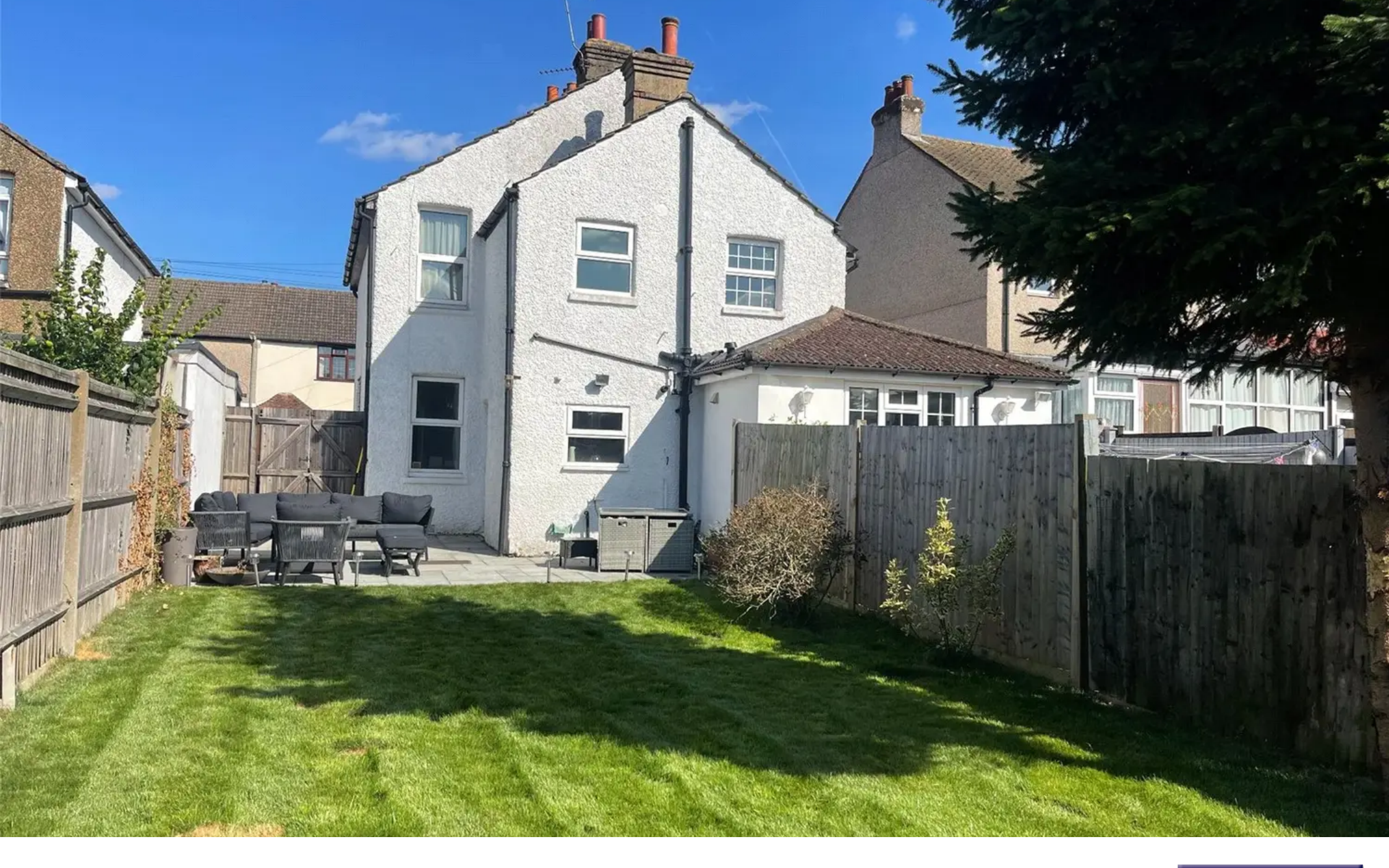
55 Alexandra Road, Warlingham - CR6 9DW Guide Price £435,000