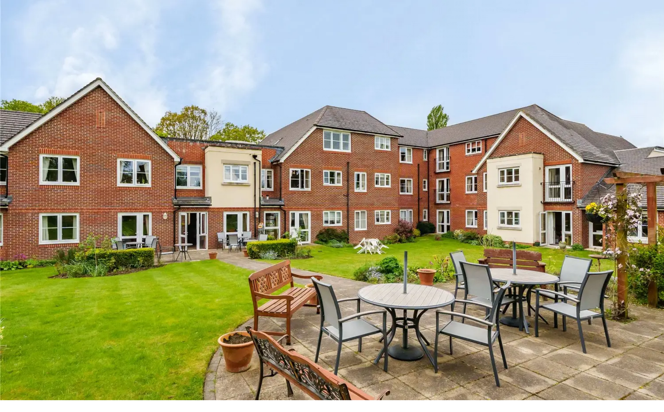
Apt 28, Greenacres Lodge, 287 Limpsfield Road - CR6 9FA Guide Price £350,000