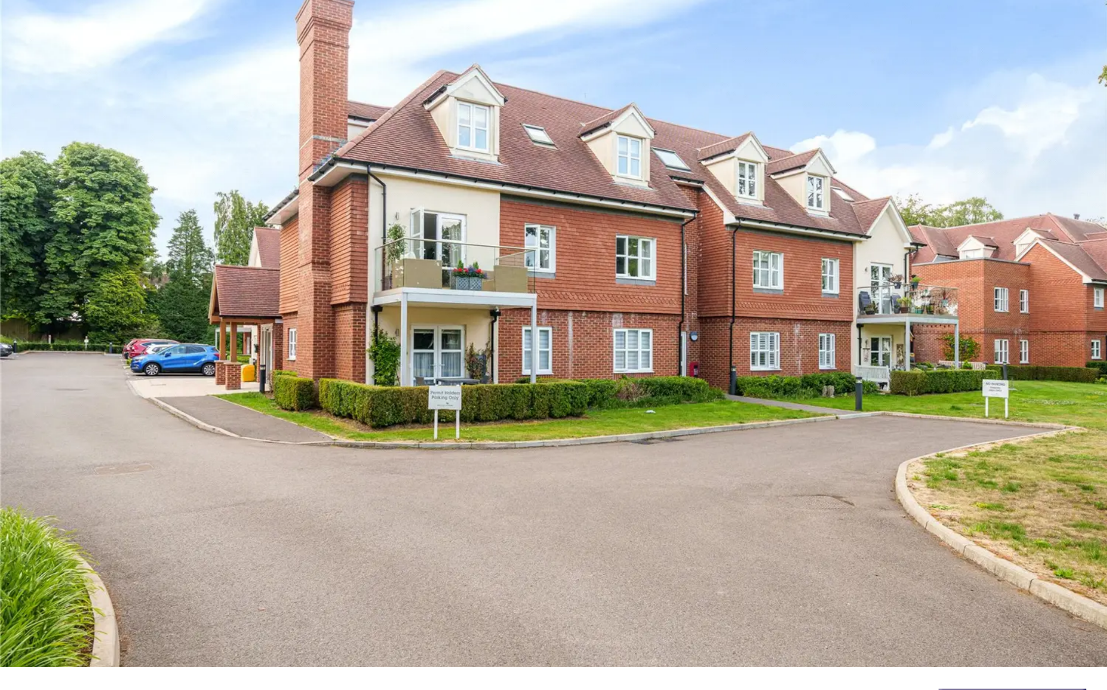
Flat 31, Langton House, 126 Westhall Road - CR6 9HF Guide Price £465,000